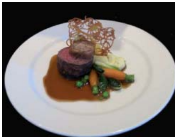
Above: The winning dish.