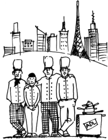
Above: The Greater Melbourne team look decidedly animated about their victory.