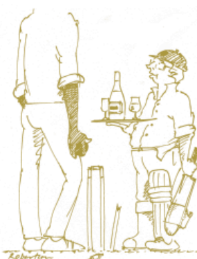
The 12th Man