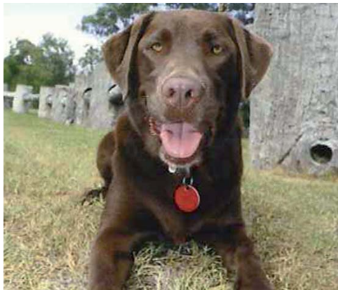
Above: Miss March, Murphy Brown, in a more demure pose.