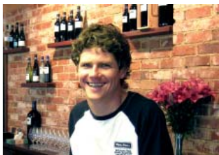
Above: Tristan is now available in Cellar Door.