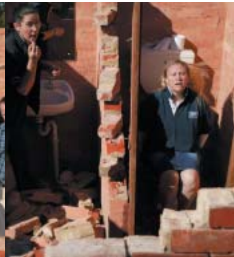
Oi, this isn't Big Brother!