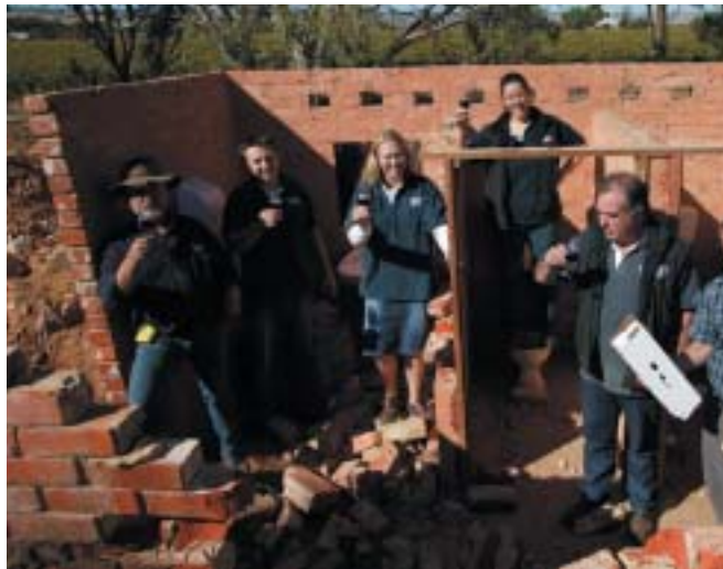
Toast to a lost civilisation