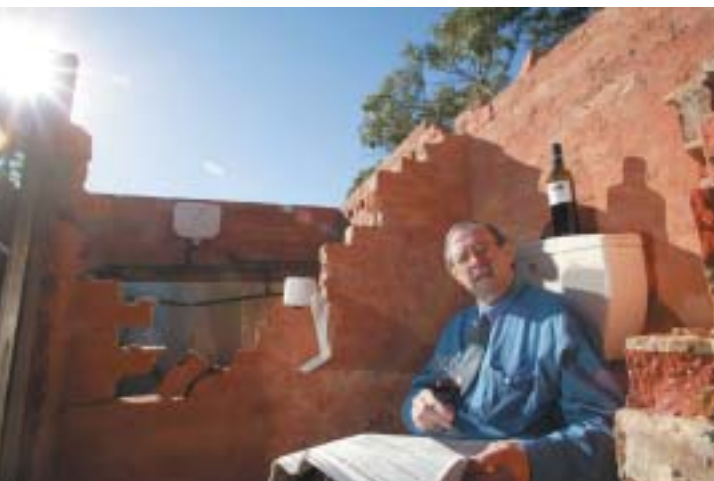
All the comforts of quiet contemplation