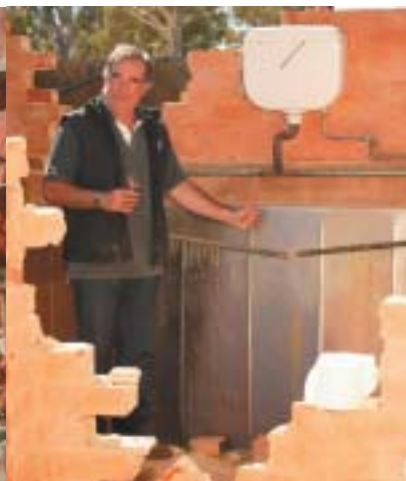
The final flush