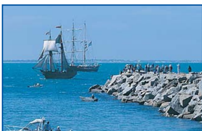
Square Rigging Festoons on the Bay