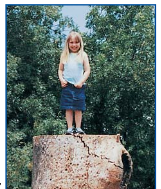
One Perfect Pixie

(TJ was heard to mutter "Where is this all going to end?" to which, of course, there is no comforting reply. ed.)