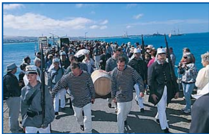
Barrel of Blend Busting Boilers