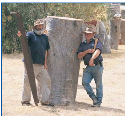
Two Terrible Trolls