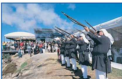
Feu de Jois