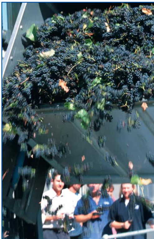
Little Late and Luscious. Vintage 2002 Encounters the Crusher.

It has been a year of significant change at Wirra Wirra. Hopefully, we can now get on with the real job at hand, making great regional wine and enhancing our quality profile in Australia and overseas.